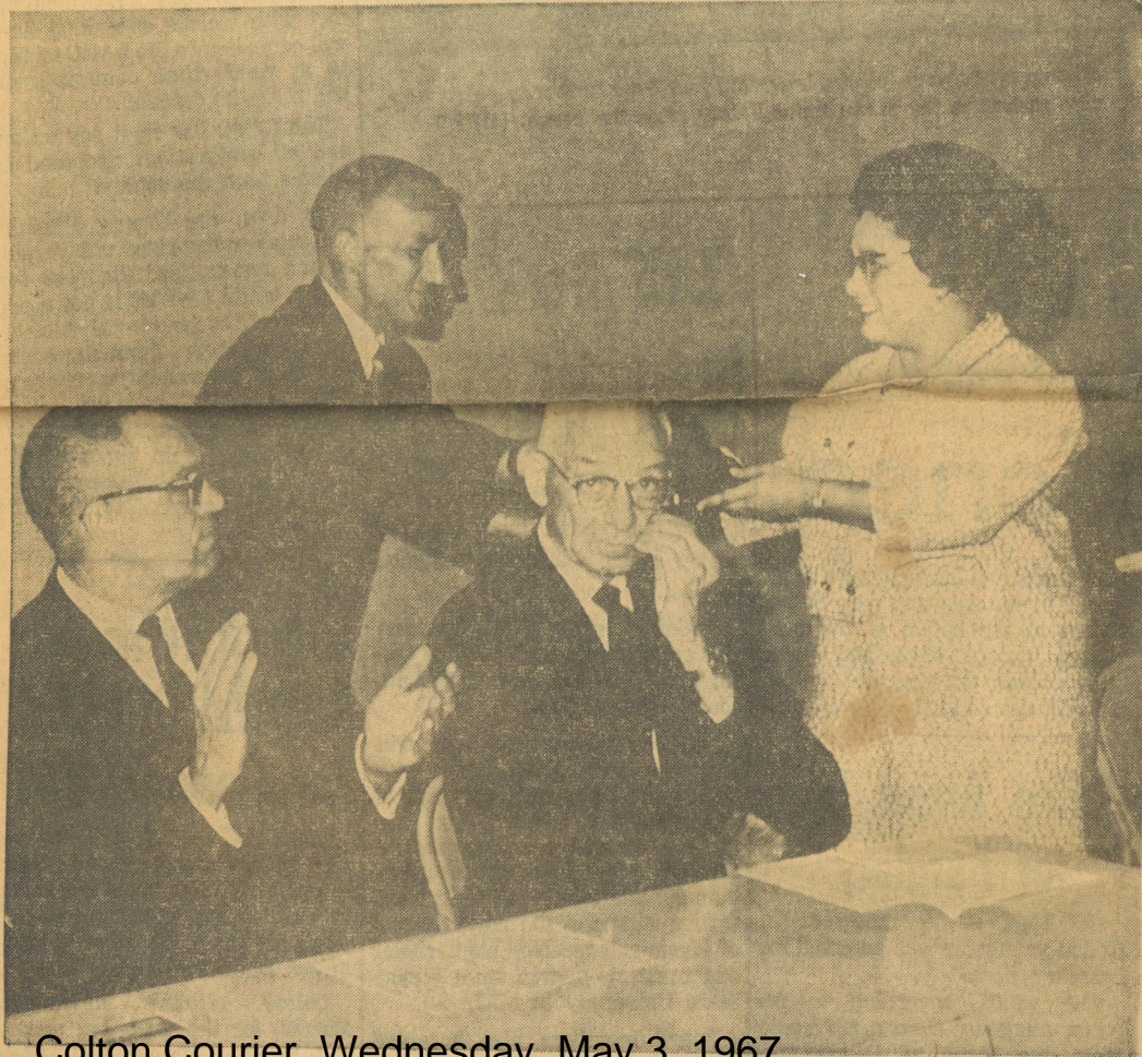
Colton Courier, Wednesday, May 3, 1967